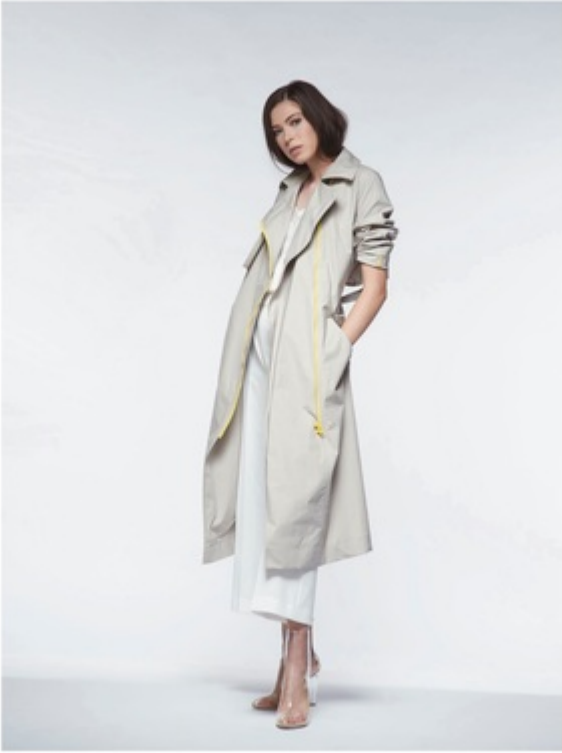
Shawl - Simul Trenches - Lara Camisols - Dinamica Trench coat - Top Shop